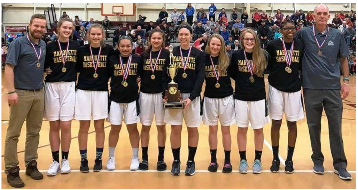
Marquette Manor Baptist Academy players and coaches celebrate after the team won the Illinois Association of Christian Schools state championship in Rockford on Saturday.